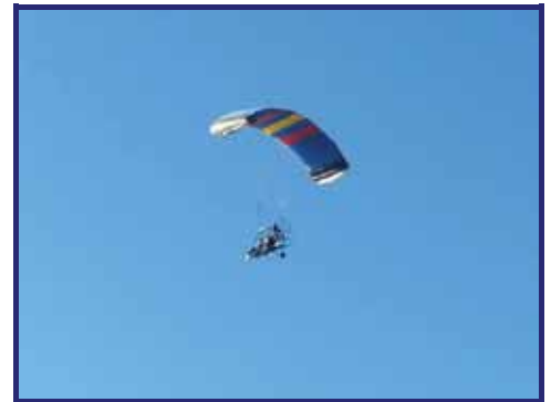
Saturday Morning Flight

There are actually two landing strips on the Ranch. One, near the Big House, is an “official” airport which you will find on the FAA’s “VFR” charts. It’s located at Latitude: 29°27’8.82” - Longitude: -99°40’44.27” -- 364 meters above sea level. The other is at the north end of the ranch and accommodates Bruce’s fantastic flying machine.