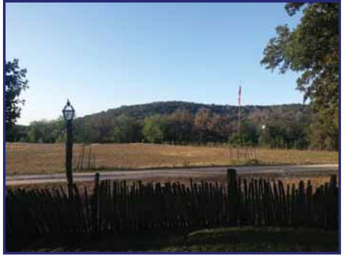
View from the Front Porch of the Big House