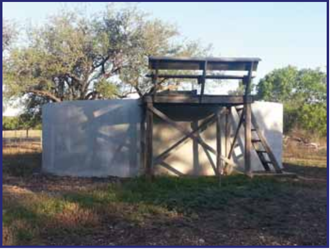
The Swimming Pool