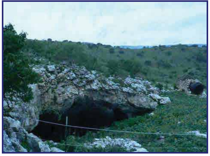
The Frio Bat Cave