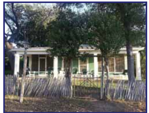
The “Big House”

There had been an old log cabin on the north end of the ranch. In 1918, it was torn down with its logs each being marked. The logs were then floated down the Frio River and the cabin was reconstructed to the west of the “Big House.” After Paul graduated from Texas A&M in