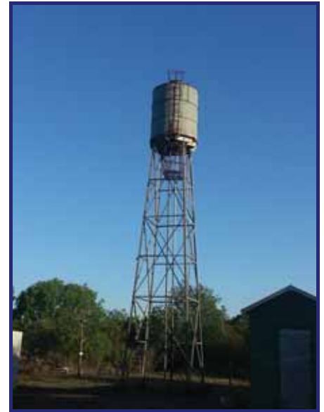
The Storage Tank