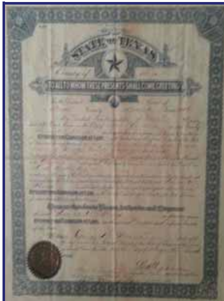
Judge Florea's Law License