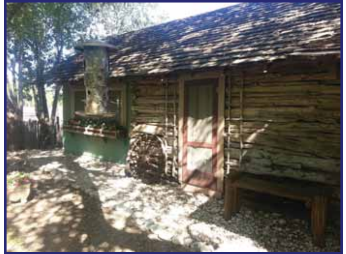
Old Meets New