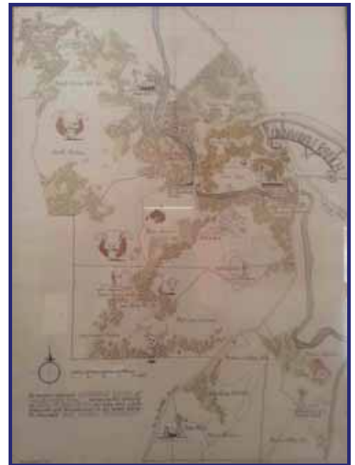
Click Any Photo to See Full Sized Image

Visits have been made to many of the “must see” Texas sites. Never, however, have I experienced the true “old” Texas, as I have in my several visits to the Annandale Ranch, in the Texas Hill Country.