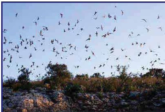
Nightly Exit from the Frio Bat Cave

The Annandale is for hunters and bird watchers. It’s for hikers and everyone who enjoys nature. The beauty of the place has always impressed me and there is something for everyone. The Annandale is even a “destination wedding” location. If you like to watch the Mexican free-tailed bats leave the Congress Avenue bridge in Austin, or the Bracken Cave west of New Braunfels in Comal County, you will truly enjoy watching the 10-12 million bats do their thing at the Frio Bat Cave, which is located on