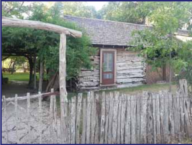
Log Cabin Back Door