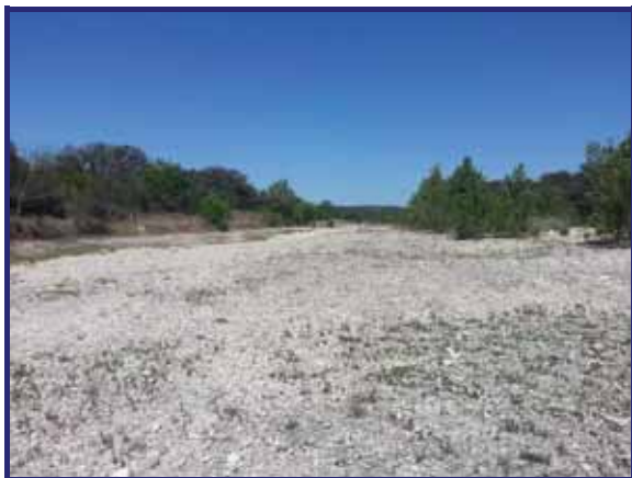
Frio River Near the Big House - May 2014

Even today, the Annandale is a working ranch where cattle, sheep and goats are raised -- the Annandale is no "dude ranch." The numerous sheds, barns, corrals and ranch related equipment such as old pick-ups and tractors will attest to that. Even the Annandale's Model T Ford flatbed is still occasionally fired up for duty.