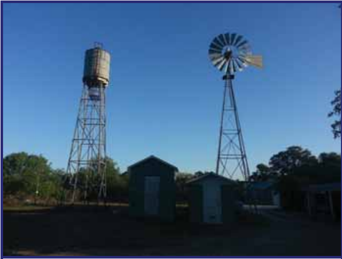
The Windmill and the Storage Tank