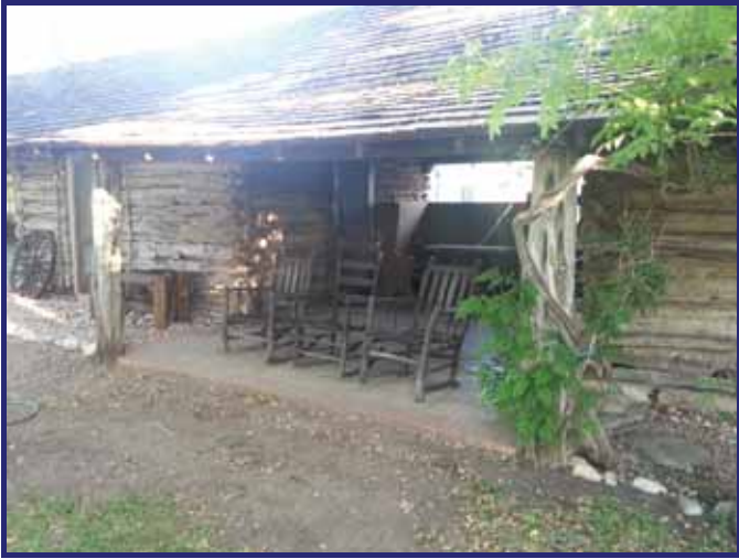
Log Cabin's Front Porch