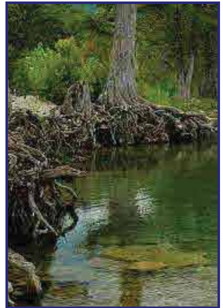
Swimming Hole at the Big Woods

The Annandale, like most of us in Texas, has been suffering through the most dramatic drought since the 1950s. The aptly named Frio River runs through the ranch for about five miles. Although the effects of the drought were apparent, there was still a delightful spring fed swimming hole at "The Big Woods." I am told that, since the ranch was founded, there has always been water at the Big Woods. The rest of the river bed, I'm afraid, was quite dry.