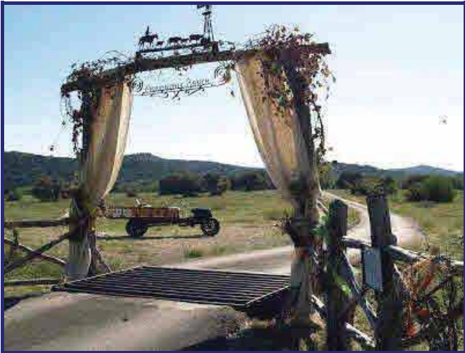
Welcoming the Bride & Groom