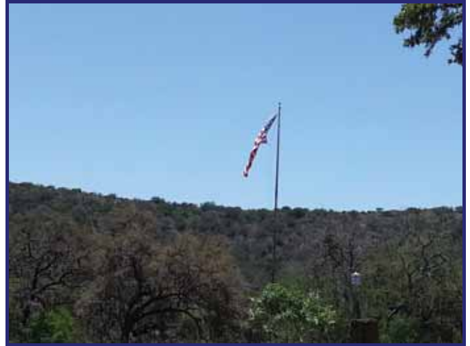
The John Wickert Memorial Flag