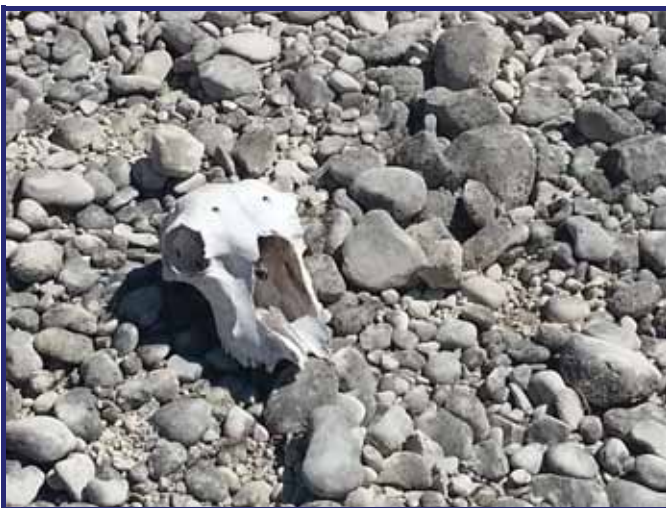
The Missing Sheep