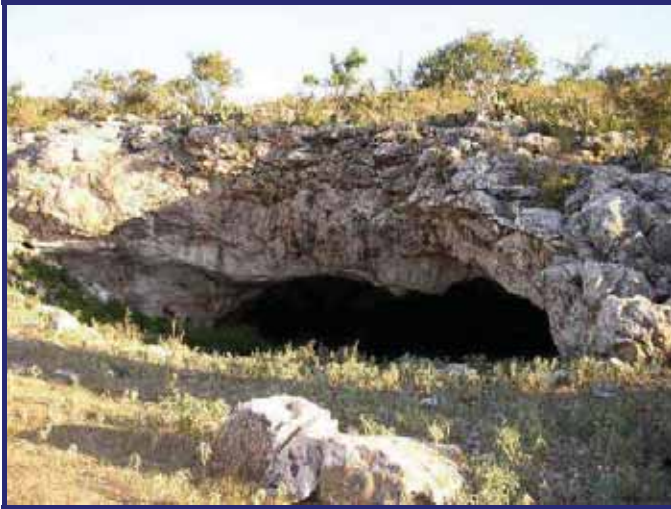
The Frio Bat Cave